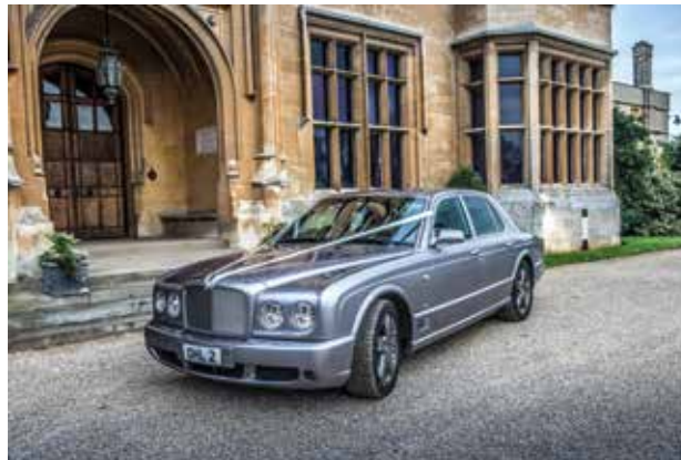
Wedding car courtesy of Studio 434

The ceremony fee and signed contract should be returned within 28 days to guarantee your booking with us. It should be noted that the hire fee does not give hirers exclusive use of the venue. Once a confirmed date is given a contract will be send to you to be signed, returned and the deposit paid. £250.00 for SG & SH ceremonies £1000.00 for full weddings.