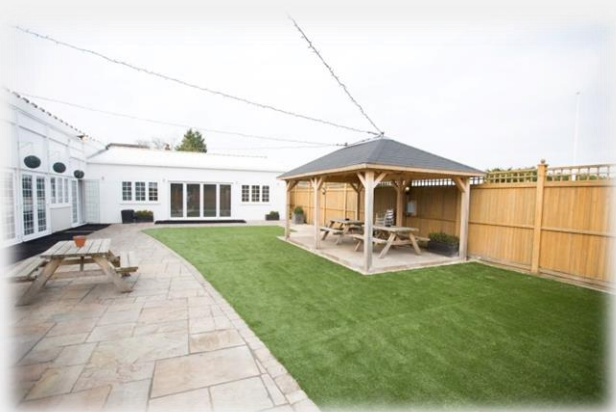
The private garden with forever green grass