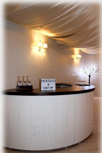
Rustic wooden cocktail bar