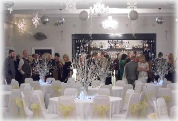
Christmas wedding complete with large snow covered tree, baubles & snowflakes

BUILT IN SUMMER 2016 Wooden pergola licenced for wedding ceremonies