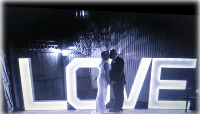
LOVE letters by Elaine