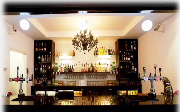
Our fully stocked staffed bar