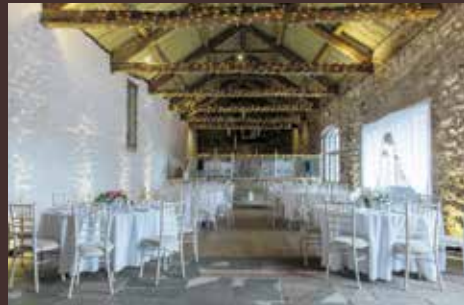
Arriving at the Bank Barn for your wedding breakfast and party.

Askham beet red onions and balsamic dress Main: stuffed rolled lo Askham pork with apricot sage stuffing gravy pots and Pud: Rich chocolate raspberry cream vanilla rare