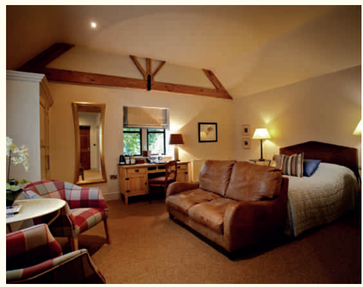
Modern, contemporary design in the Garden House