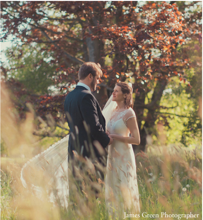
James Green Photographer