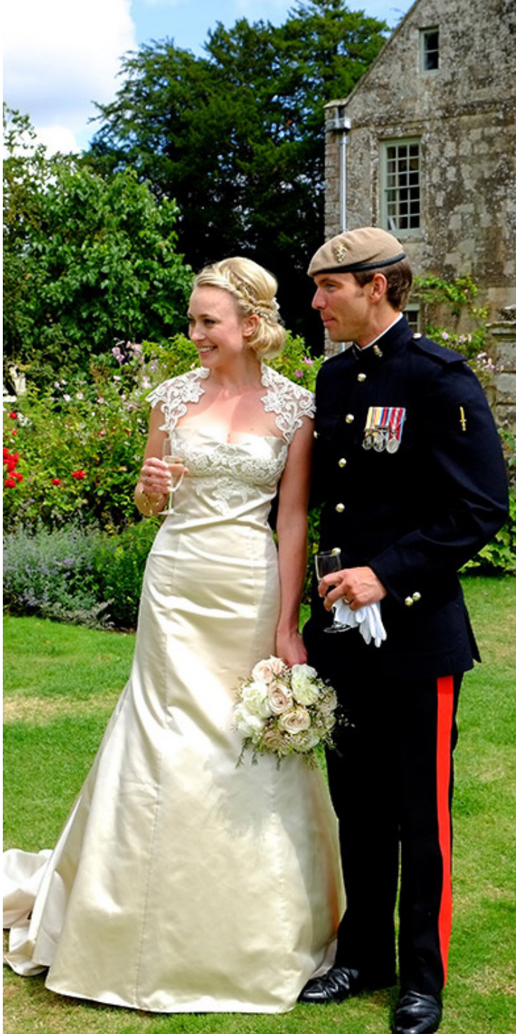
Hatch House, West Hatch, Tisbury, Wiltshire, SP3 6PA