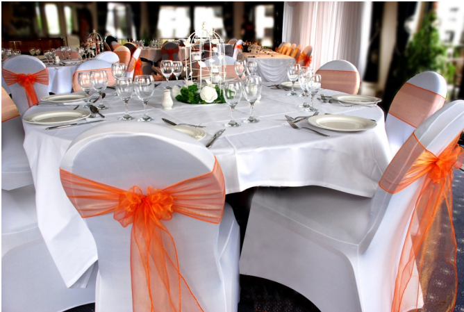
Table decoration by Perfect Chairs

The Clubhouse Lounge also includes an integral dance floor, available for evening receptions at your request. It is the perfect room for a live band or a disco with additional disco lighting and mirror ball, ideal for such occasions. A broad, wooden balcony, spanning all three sides of the Lounge, offers outdoor seating and lots of possibilities.