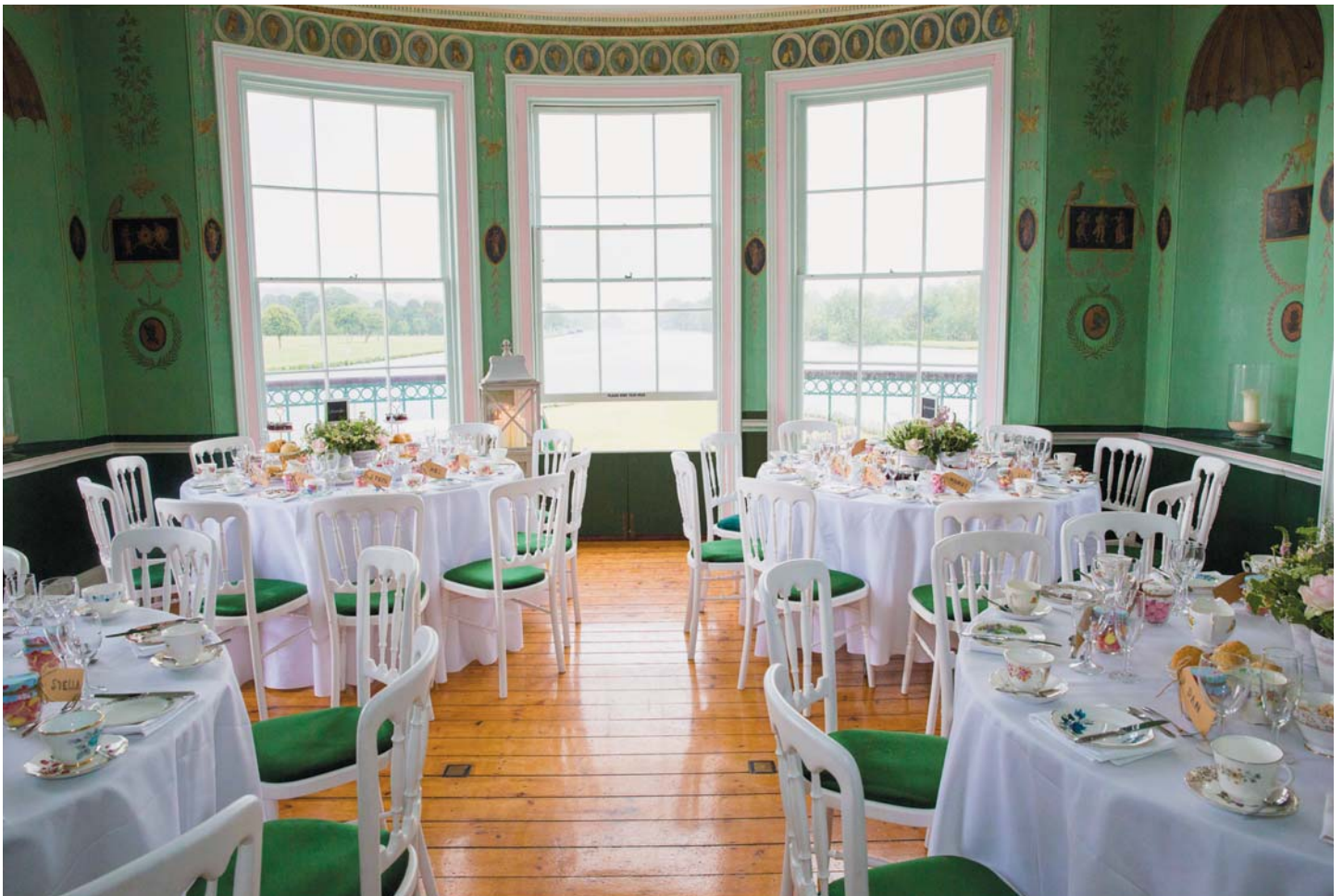
The Etruscan Room

The frescos, now beautifully restored, were based on designs which had just been discovered at Pompeii around the time the Temple was built in 1771. This is the first example in England of the form of ornamentation which came to be known as the Etruscan Style.