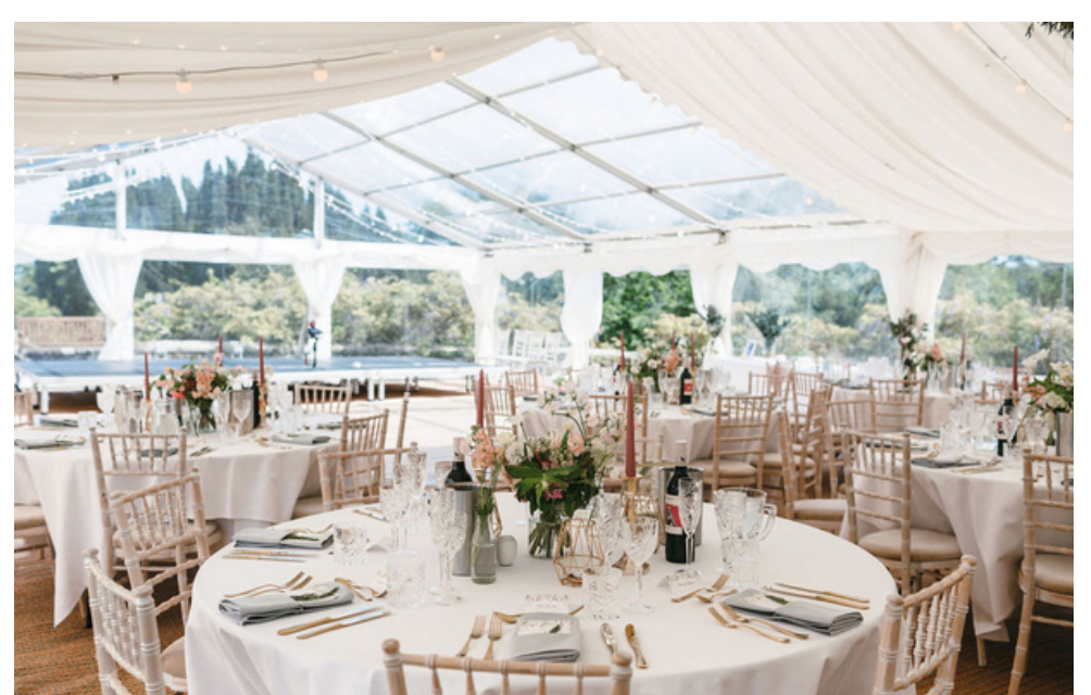
Emily & Rich's sustainable outdoor wedding