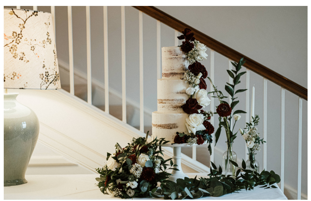
Donna & Ryan's autumnal wedding