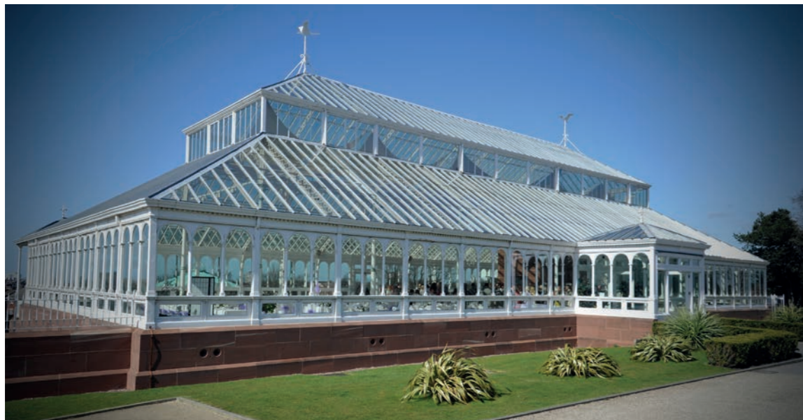
The Isla Gladstone conservatory is a magnificent example of Victorian architecture. Serene, warm and inviting.