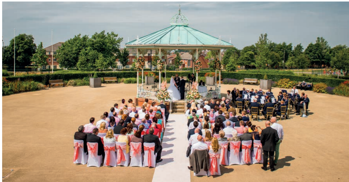
Adjacent to the conservatory is our fairy tale bandstand, the original licensed, outdoor space for wedding ceremonies in the city.