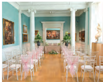
Naples Saloon up to 40 people