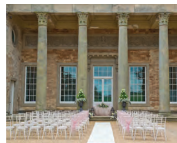
Courtyard up to 100 people

Please note that a registrar must be booked independently. Contact Warwickshire Registry Office on 01926 413724 or email warwickro@warwickshire.gov.uk