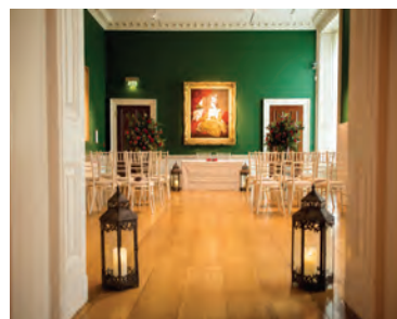
British Portraits up to 30 people