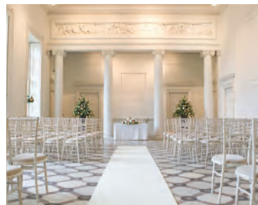
Adam Hall up to 100 people

The Adam Hall with its ornate ceiling and marble floor is available for wedding ceremonies of up to 100 guests. We also have a choice of other licensed rooms for smaller ceremonies and outdoor areas for warmer weather.