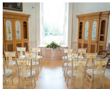
Lakeside up to 12 people