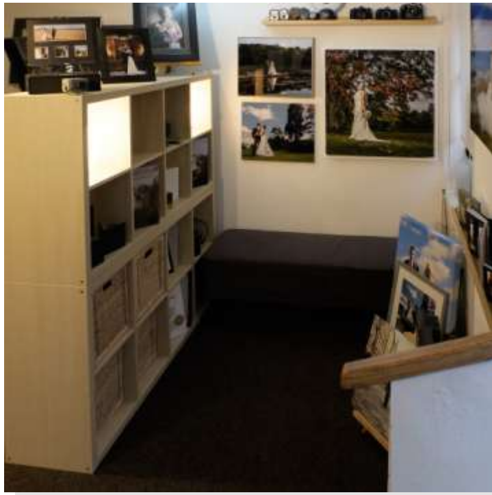
Lots of samples in our shop on Dunbar High Street