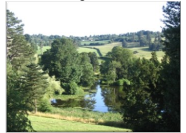
Looking SE from the Terrace