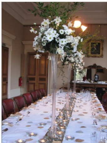
Dining Room table set for 20