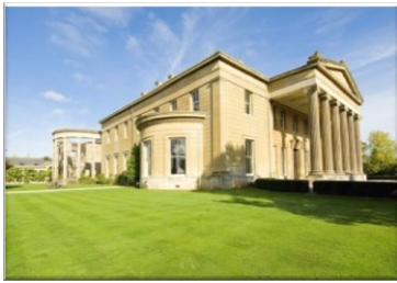
Whitbourne Hall from the Terrace