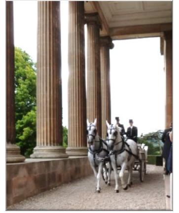
Bridal Carriage under the Portico