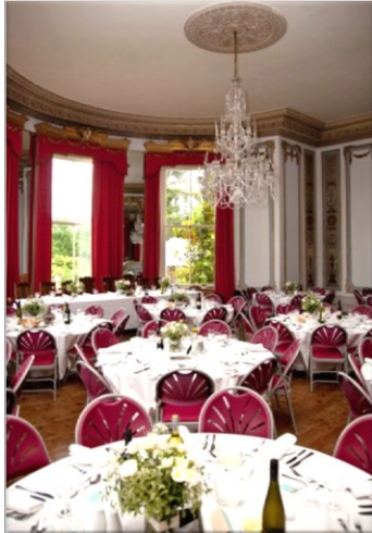
The Drawing Room