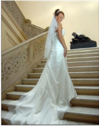
Bride on the marble stairs