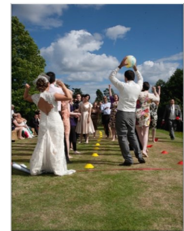
Games on the Terrace