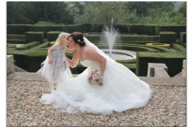
Secrets on the Italian Garden steps

Telephone 01886 821165 www.whitbournehall.com