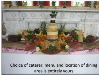
Choice of caterer, menu and location of dining area is entirely yours