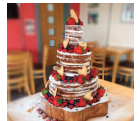
NBF Cake Stand