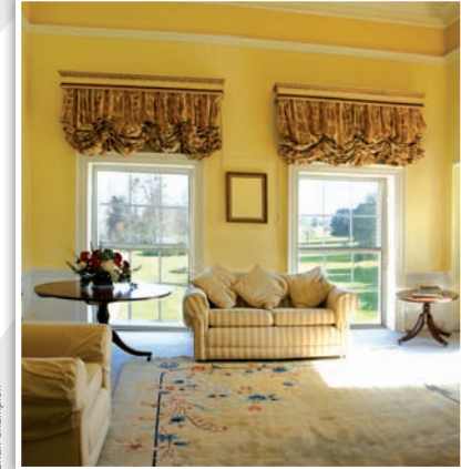
The East Tennyson apartment offers delightful self-contained accommodation for one or two people for short or long stays.

Avington's staff will be happy to help you organise large dinners, lunches and wedding breakfasts, as well corporate receptions and conferences.