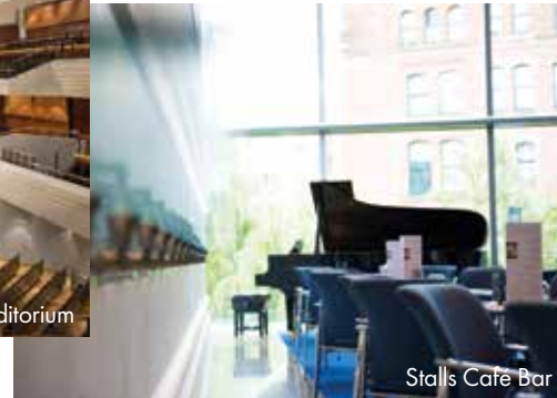
Stalls Café Bar