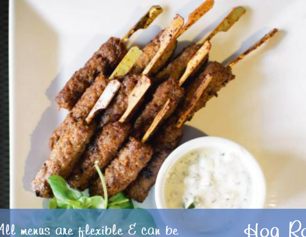
All menus are flexible E can be adapted to your requirements. Food prices are per person E include relevant table linen, crockery, cutlery, staff, tea/coffee E chocolates